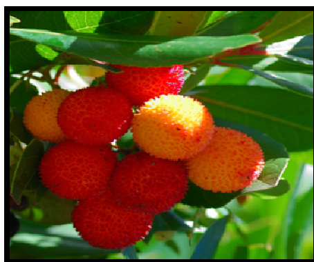
Figure 1: Arbutus unedo L. Fruit

The ripened fruit of Arbutus unedo L. (Figure 1) was collected from Guezoul forest locally know “Oued el Lendj”, which is located on the western of the city of Tiaret (in the southern of Algeria). Indeed, harvesting was at an altitude of about 1040 m. These fruits are washed, wiped, sorted, and stored frozen at -20^{\circ}\text{C} for analysis purposes. They have been used to obtain fruit juice and essential oils extract.